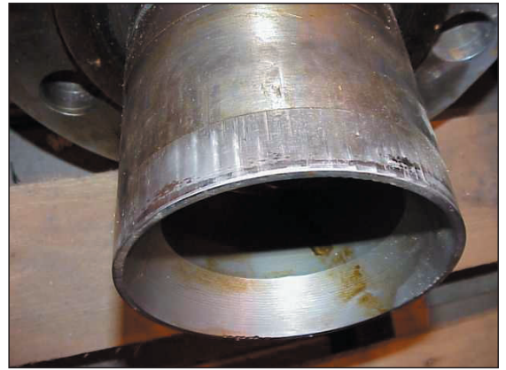
Figure 2. Valve plug damage due to low-lift erosion

Even if the feedwater valves are supplied with Class V shutoff, there is still the possi-