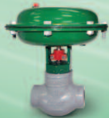
D2 FloPro™ Control Valve