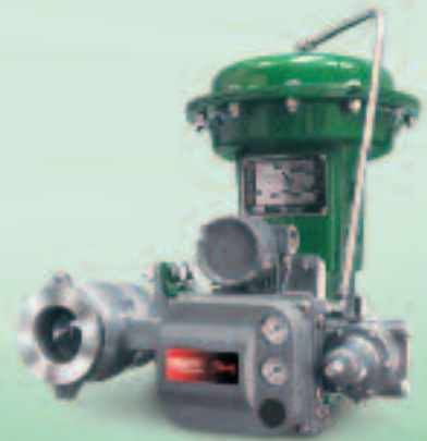
FIELDVUE Natural Gas Certified