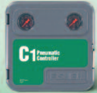
C1 Pneumatic Pressure Controller