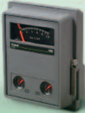
4195K Series Pressure Controller