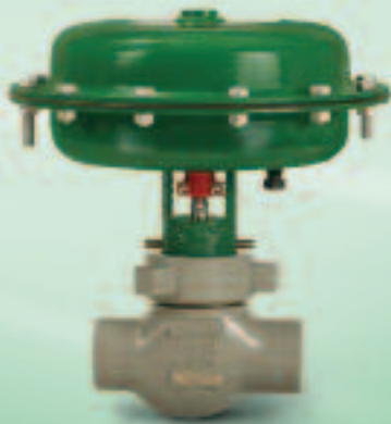
D3 FloPro Control Valve