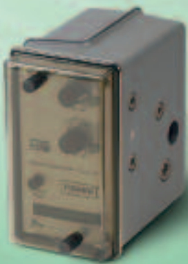
4660 High-Low Pressure Pilot

Bottom Line Results - You can realize maximum uptime, safer operations, and lower energy use with Fisher oil and gas equipment. What’s more, the equipment is easy to install and is cost effective for you.