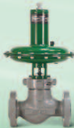
D4 Control Valve