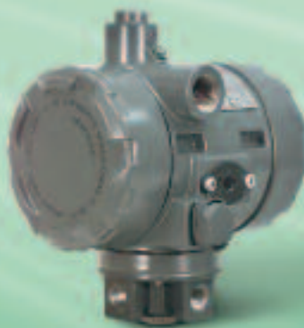
i2P-100 Electro-Pneumatic Transducer