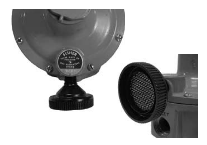
Figure 5. An auxiliary vent assembly can be installed in threaded non-drip lip vents.