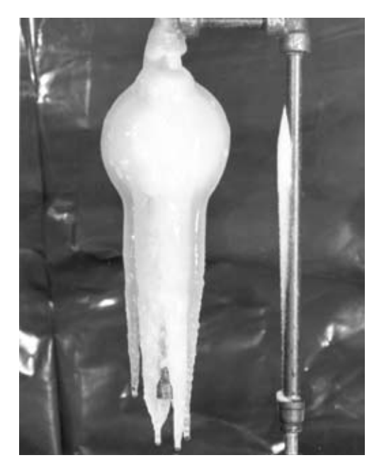
Figure 2. Ice completely covered the regulator Fisher Controls used in the freeze tests.