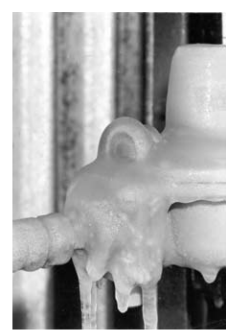
Figure 4. Vents on horizontally mounted regulators became quickly plugged during Fisher's tests.