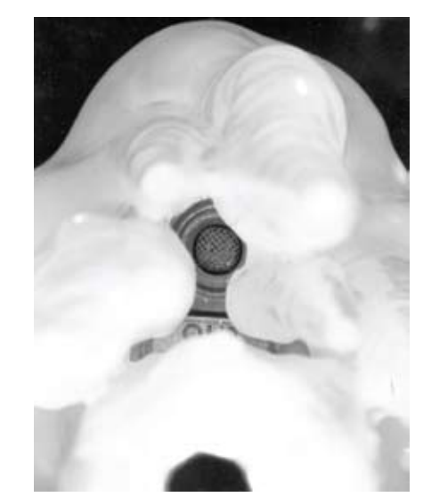
Figure 3. Looking up into the vent of the same regulator as shown in figure 2 reveals that the opening remains unplugged.

Tests also showed that drip lip regulators installed in a horizontal position had their vents plugged by the simulated freezing rain in a matter of seconds (see Figure 4). U.L. has been and currently is conducting its own freeze test program with regard to regulator vents. The laboratories require a manufacturer to label regulators which fail to pass the U.L. vent freeze-over test with the following: "CAUTION: For outdoor use, install under a protective cover."