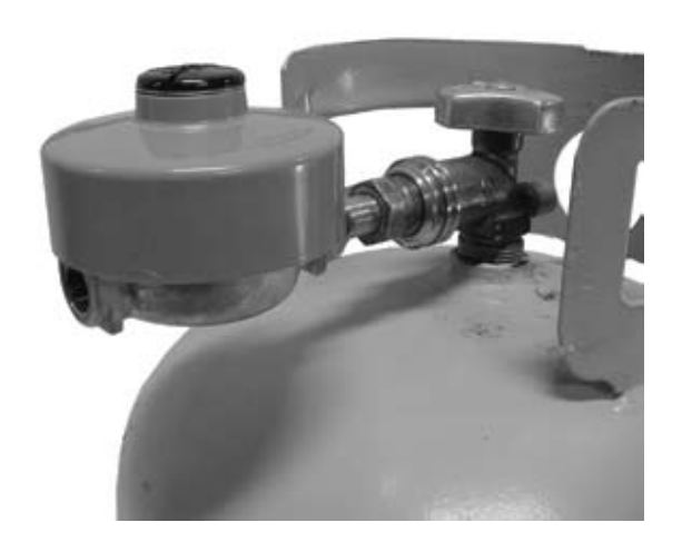
Figure 7. Encasements or vent protectors may be able to solve the horizontal mounting problem.

All regulators should be inspected periodically for internal corrosion. Condensate or water can collect in the regulator's spring case, especially on horizontally mounted or insufficiently sloped units, and cause corrosion of the internal parts. If any corrosion or water marks are visible within the spring case, the