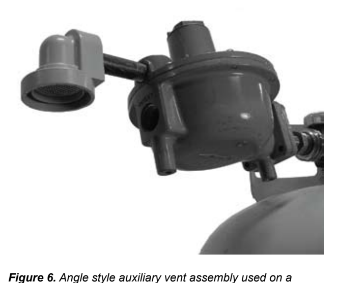
horizontally mounted regulator.

liability law, and it affects everyone in the distribution chain—the manufacturer, the reseller, the installer, and the gas marketer. Each can be sued (together or separately) if there is an accident with a particular piece of equipment or system. It's up to these people to be able to show that they were not at fault and that they acted in accordance with the codes and rules of the applicable governing bodies.