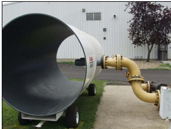
Figure 2: Duct/Sparger Testing Arrangement

Another demonstration conducted showcased a common configuration of a sparger inserted into a condenser duct. Fisher 2 shows the sparger/duct testing apparatus at the Marshalltown Research Facility.