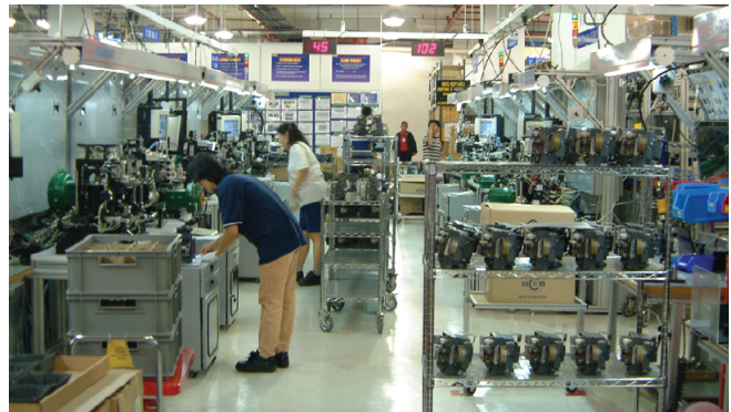
Production employees in Singapore ship hundreds of FIELDVUE® Digital Valve Controllers every week.

FIELDVUE team members worldwide have also worked to broaden the range of potential applications. Digital Valve Controllers are now available for fieldbus (DVC5000f) installations, safety-instrumented systems (DVC-ESD), and high temperature (remote-mount) valve applications.