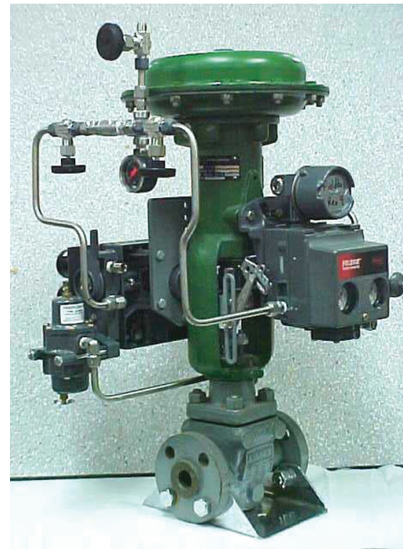
The unusual cabling on this control valve enables a "live" cut over from an old analog positioner to a new FIELDVUE® DVC Digital Valve Controller with FOUNDATION™ fieldbus

Later, when there is a scheduled turnaround, the DVC instruments can be easily converted to travel control and the old pneumatic positioners will be removed.