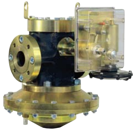
CB Regulator + Shut-off