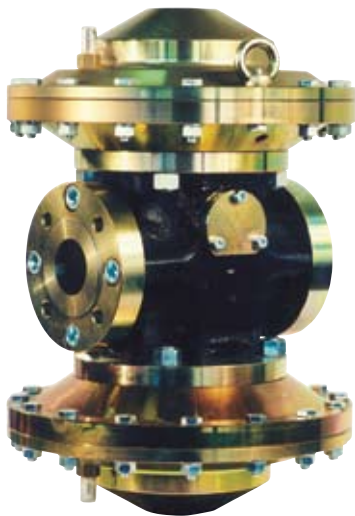
CC Regulator + Monitor