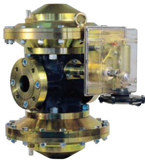
CCB Regulator + Monitor + Shut-off