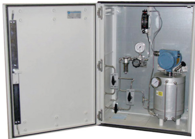
3098 in a Cabinet

The refinery chose to install a Micro Motion® 3098 Gas Specific Gravity meter because of its ability to provide a continuous, fast on-line molecular weight measurement. Gas Specific Gravity is critical because surge is a volumetric flow phenomena. As the composition might fluctuate, the volume flow might fluctuate unexpectedly as measured by other devices. This meter provided the molecular weight and specific gravity measurements, independent of process conditions. The meter enabled them to more accurately determine the surge limit, and operate with increased efficiency and reduced risk of damage due to surge.