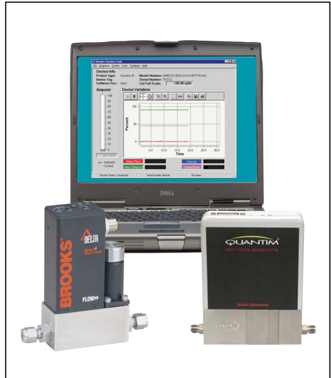
Figure 1 – Brooks Service Tool™ Running On PC / QUANTIM Coriolis and Delta Class Mass Flow Products