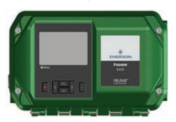
Figure 1. Fisher FIELDVUE DVC7K Digital Valve Controller