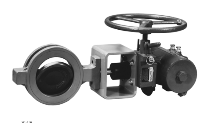
Figure 1. Fisher 1079 Manual Actuator Mounted on a Hytork Actuator and A41 Double D Valve