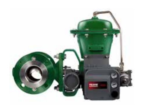
Flanged body design with a Class 150, 300, or 600 rating.