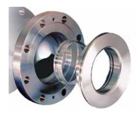
Heavy-Duty (HD) Seal The heavy-duty ball seal offers exceptional wear and pressure drop performance over a wide range of steam, gas, liquid, and slurry applications. The metal seal is pressure-balanced, which reduces operating torques and allows higher pressure drops without excessive wear.