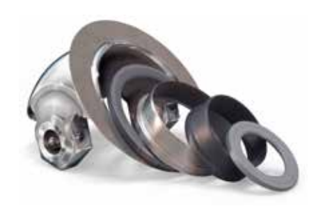
Trim Interchangeability Across the Vee-Ball line, size-for-size, trim components remain the same regardless of body style. This reduces parts inventory requirements and costs. It also simplifies maintenance training and procedures.