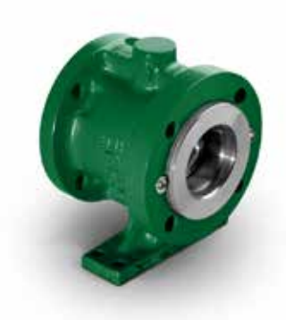
Structural Integrity The one-piece body improves structural integrity of the pressure boundary by eliminating the potential leak paths found in two-piece, bolted valve designs.