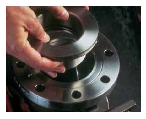
Easy Seal Replacement and Inspection Once the valve is removed from the pipeline, just remove two screws and the seal assembly is easily extracted from the body. No need to disassemble the valve body or remove the actuator. Metal and soft seals are fully interchangeable.