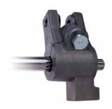
Accurate Positioning A splined driveshaft coupled with clamped actuator lever helps ensure zero lost motion.