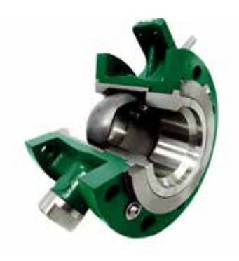
Erosive Slurry Control The V150S Slurry Vee-Ball valve has a body liner, V-notch ball, and flow ring, all constructed of high-chromium iron. A ceramic flow ring insert is available for especially aggressive slurry services. V150S erosion-resistant trim components protect the body from erosive wear and are retained without the use of press fits or threads for easy replacement.