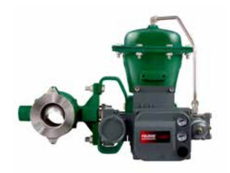
Flangeless body provides a multi-class rating.