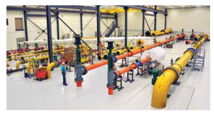
Extensive flow loop testing has demonstrated the Vee-Ball valve's low friction performance advantage in controlling process variability.