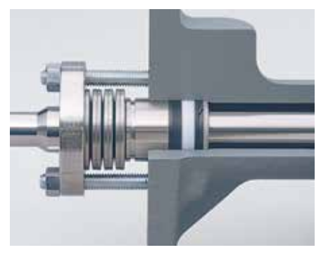
Shaft Packing Options A choice of shaft packing systems provides enhanced shaft sealing to meet specific application requirements. ENVIRO-SEAL™ packing is available in all Vee-Ball valves and helps meet stringent emission control requirements.