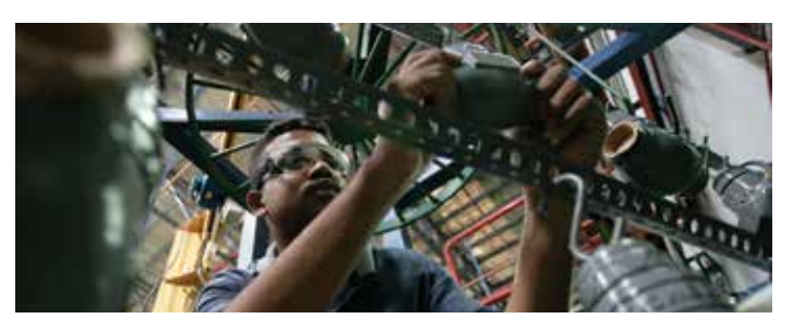
The V-notch ball seal can be replaced without valve disassembly or actuator removal.