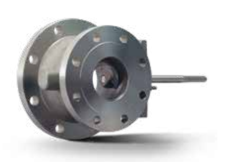
Medium Consistency Pulping The V150E expanded outlet Vee-Ball valve accommodates expanded downstream piping. The V150E outlet flange is one standard line size diameter larger than the inlet. The expanded outlet geometry streamlines the flow through the valve as the flow area increases from inlet to outlet.