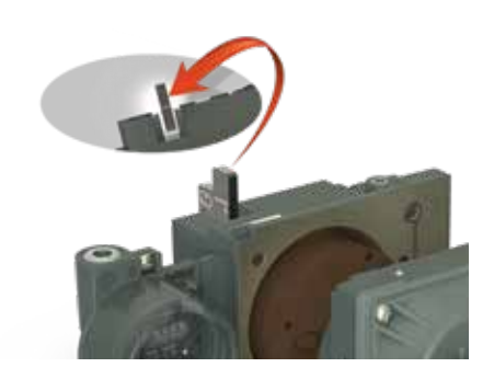
Better Linkage Protection Integral mounting of the positioner protects linkages. With no sliding parts to wear, loosen, corrode, or vibrate, a magnet array and Hall Effect sensor are used to detect valve position. This technology provides a robust solution for harsh environments and nonstop cycling.