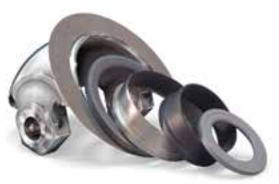
Vee-Ball seal types shown include Flat Metal, TCM (composition), and HD.