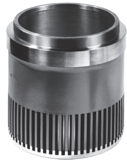
FISHER EWT METAL-SEAT VALVE WITH WHISPER TRIM I CAGE